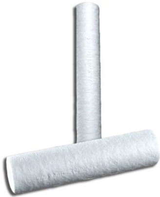
Figure 1 : Hytrex Depth Cartridge Filters